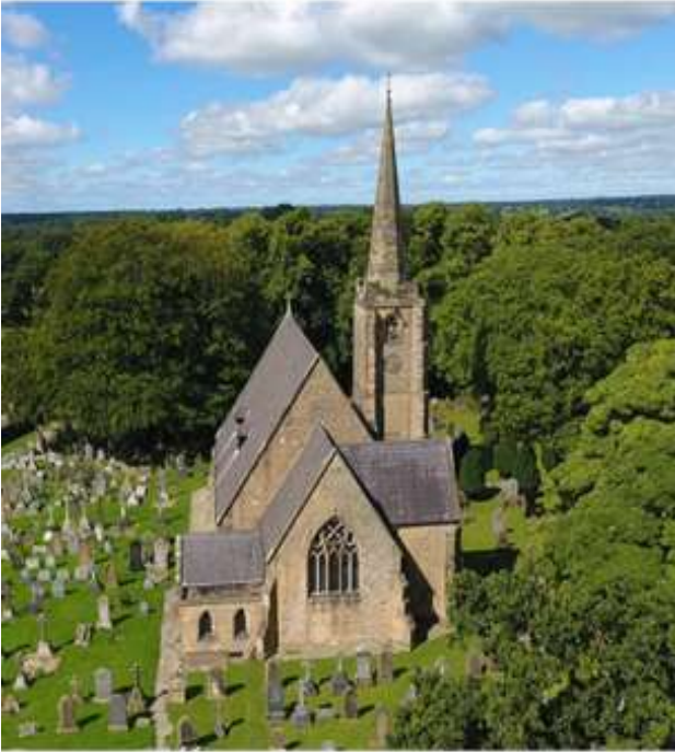
St Leonard's Balderstone

If you know anyone who would like to be added to our mailing list, please ask them to email unitedbeneficebms@outlook.com or, for anyone who is not online, please phone 01254 814041.