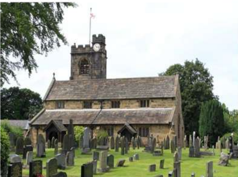
St Leonard the Less Samlesbury