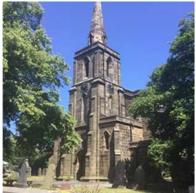
St Mary's Mellor