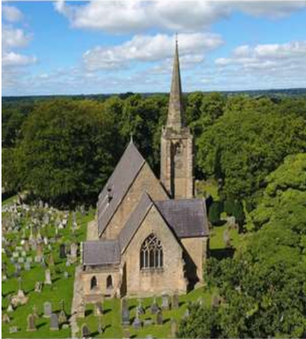
St Leonard's Balderstone

If you know anyone who would like to be added to our mailing list, please ask them to email unitedbeneficebms@outlook.com or, for anyone who is not online, please phone 01254 814041.