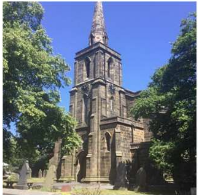
St Mary's Mellor